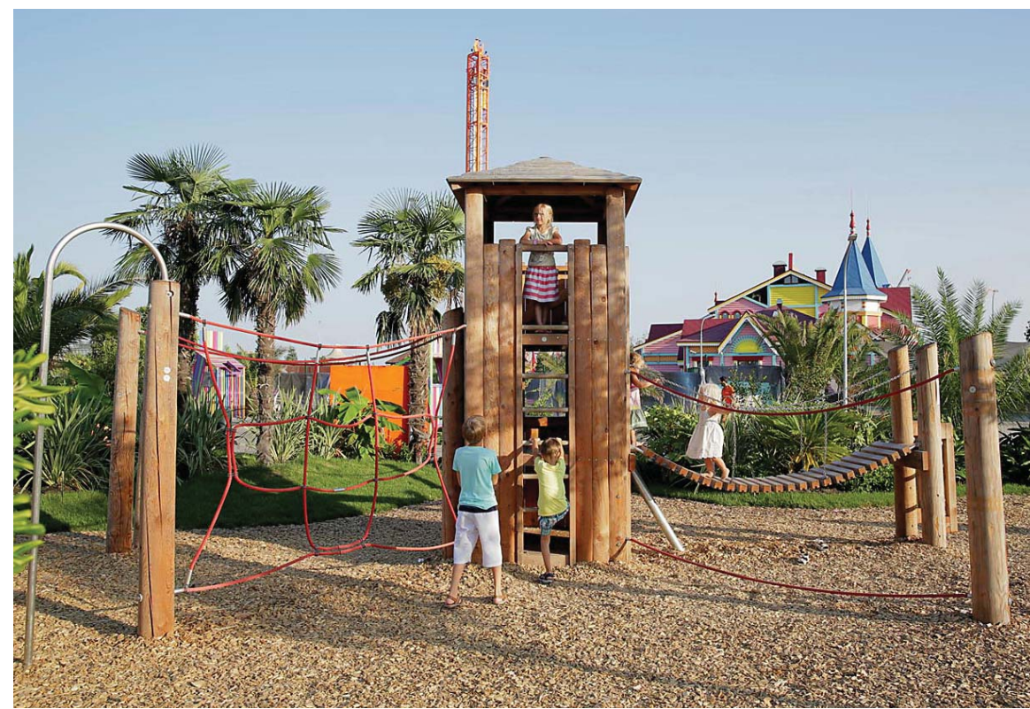
2. Tower Combination